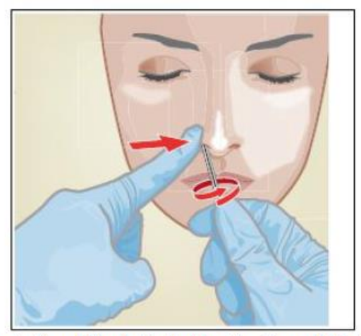
Figure 3. Nasal Swab Collection for Second Nostril

5. Repeat on the other nostril with the same swab, using external pressure on the outside of the other nostril ( see Figure 3 ). To avoid specimen contamination do not touch the swab tip to anything other than the inside of the nostril.