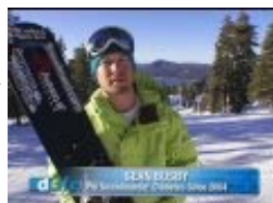
Inspirational People with Diabetes by lwproductions73