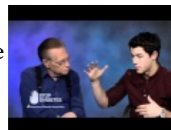
Nick Jonas & Larry King: Living with Diabetes by AmericanDiabetesAssn