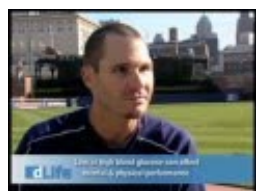
Athletes with Diabetes (interview Mash-up!) by dlife