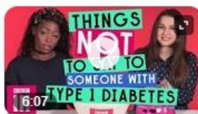
Things Not To Say To Someone With Type 1 Diabetes by BBC