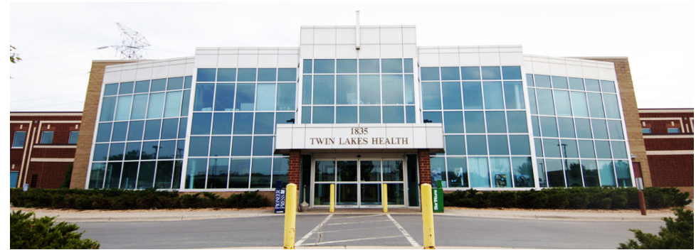
The clinic is in the Twin Lakes Medical Building.

Traveling north on Snelling Avenue, cross Hwy 36 and continue north to County Road C. Turn left and travel west on County Road C to Fairview Avenue. Turn right on Fairview Avenue, followed by an immediate left into the Twin Lakes Medical Building parking lot.