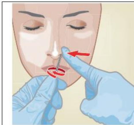
Figure 2. Nasal Swab Collection for First Nostril

4. Insert a nasal swab 1 to 1.5 cm into a nostril. Rotate the swab against the inside of the nostril for 3 seconds while applying pressure with a finger to the outside of the nostril ( see Figure 2 ).