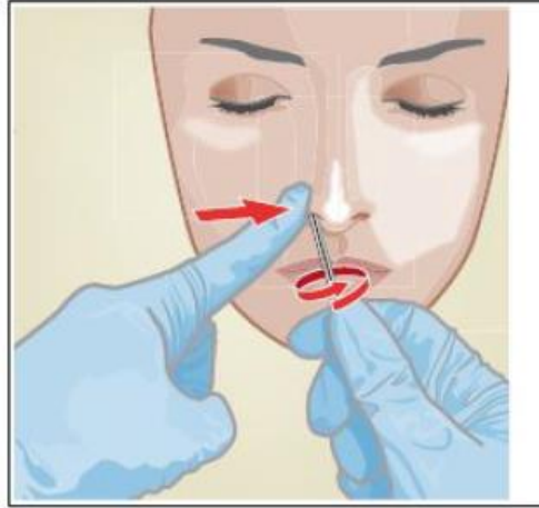
Figure 3. Nasal Swab Collection for Second Nostril

5. Repeat on the other nostril with the same swab, using external pressure on the outside of the other nostril ( see Figure 3 ). To avoid specimen contamination do not touch the swab tip to anything other than the inside of the nostril.