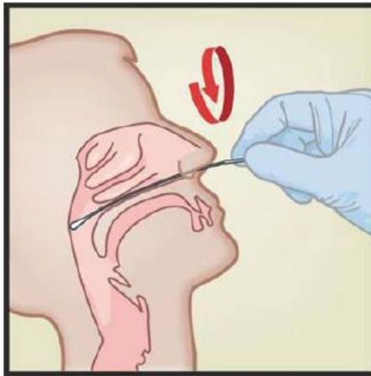
Figure 1. Nasopharyngeal Swab Collection

4. Gently insert the swab into the nostril until you touch the posterior nasopharynx. Rotate the swab several times ( see Figure 1 ).